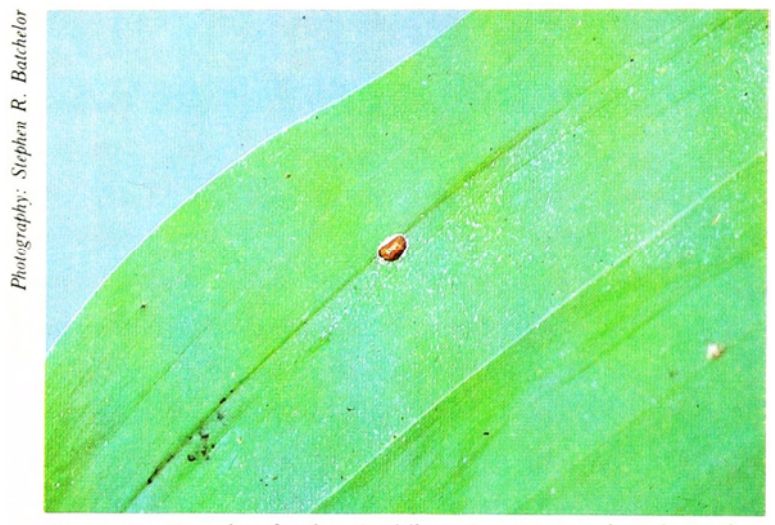
FIGURE 3 — A species of scale quite different in appearance from the species pictured in FIGURE 2 is securely covered and attached to this Cycnoches chloro-chilon leaf. The surrounding, light stippling is indication of an incipient spider mite attack.

In their mature stage, both scale and mealybug are generally oval in shape and clearly visible to the unaided eye. Species of