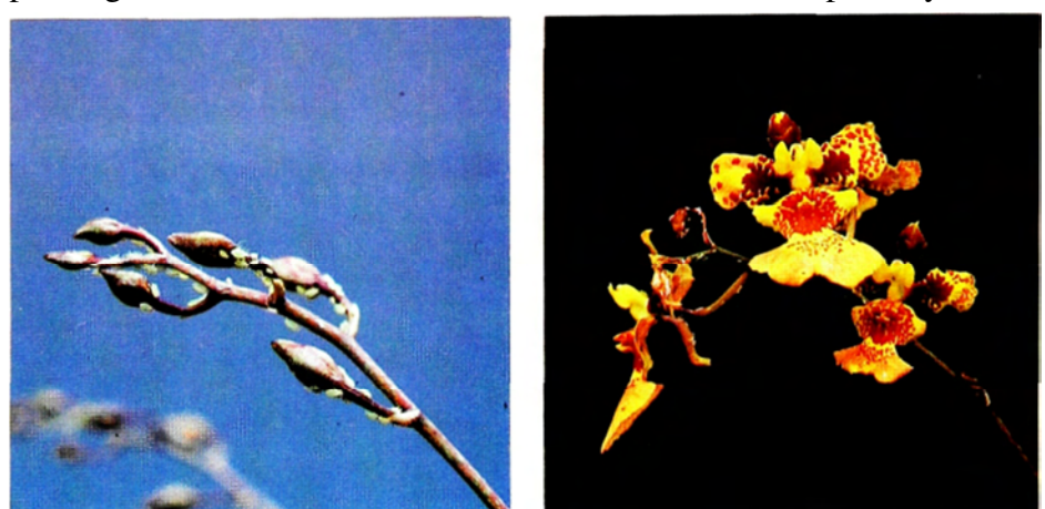
FIGURES 6 and 7 — Parasitized by aphids, and drained of their vital juices from bud stage (left) till flowering (right), these Tolumnia Golden Sunset flowers show a severe reduction in size.

Orthene, emulsion or wettable-powder, is one of the more effective sprays for control of mealybug and scale. Its residual effect is more prolonged than that of the better-known Malathion. Especially with