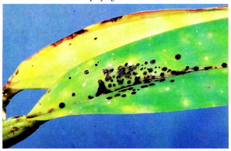
FIGURE 5 — prolonged scale attack causes yellowing and necrosis of infested leaves and pseudobulbs. Note that even though this picture was taken after an insecticide spraying some scale still remains.